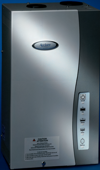
Model 800 Steam Humidifier